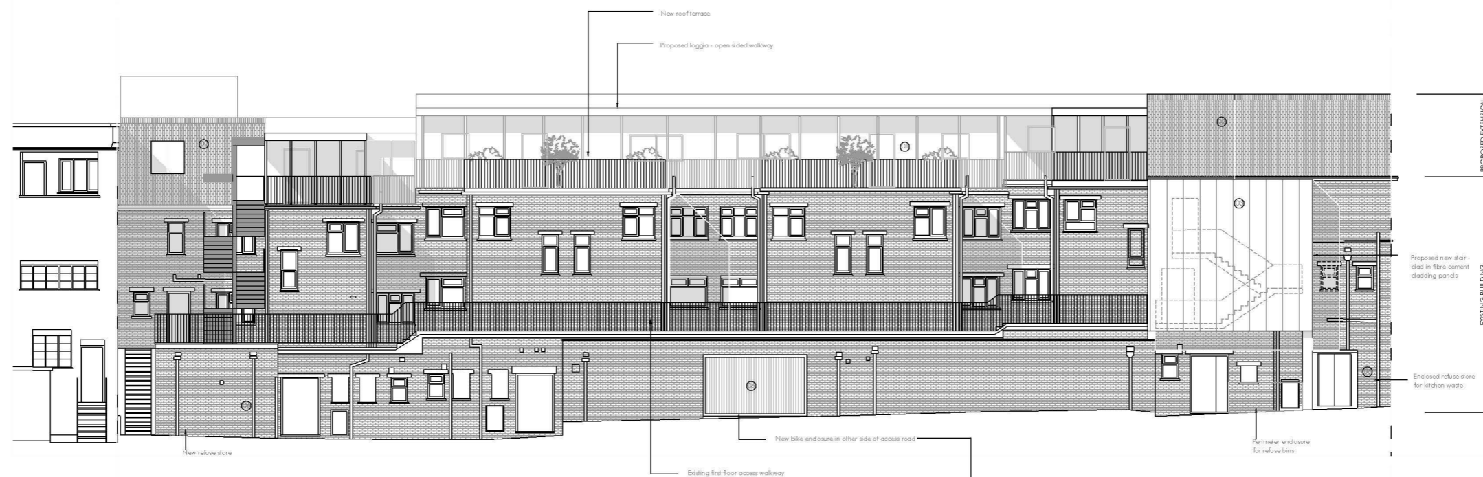
PROPOSED REAR ELEVATION (SOUTH EAST)