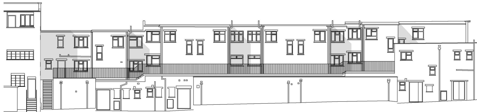
EXISTING REAR ELEVATION (SOUTH EAST)