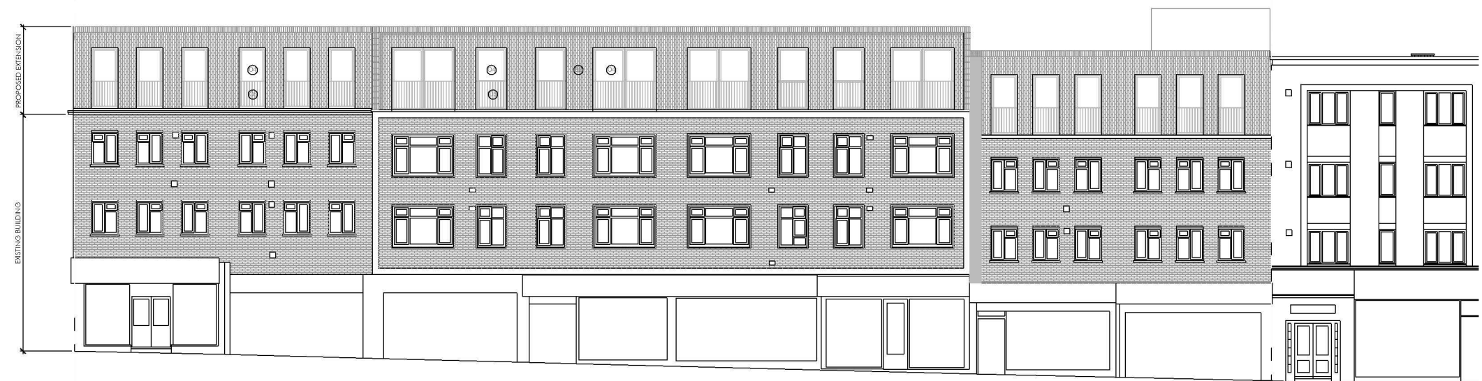
PROPOSED ELEVATION (NORTHWEST)