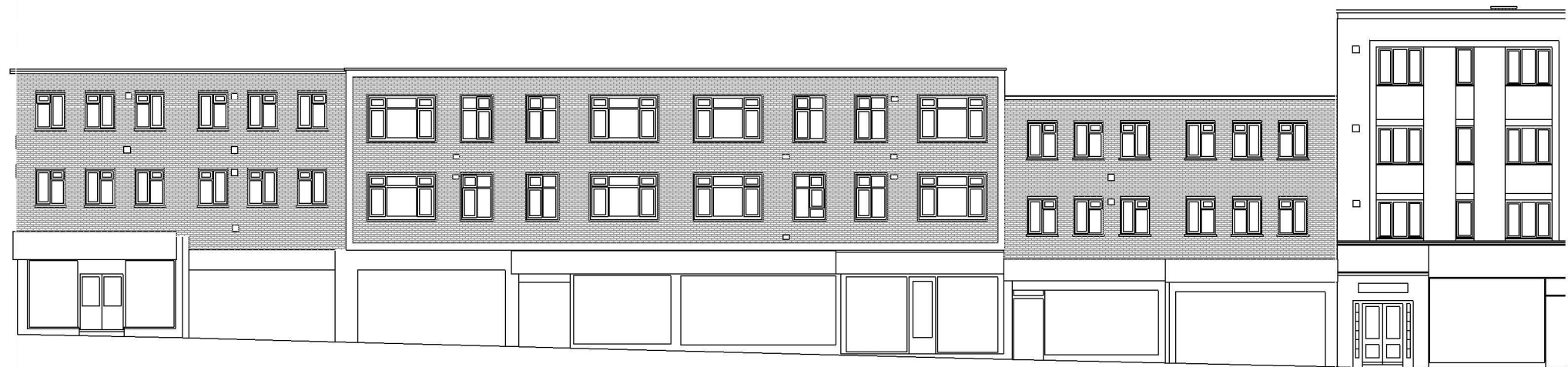
EXISTING ELEVATION (NORTHWEST)