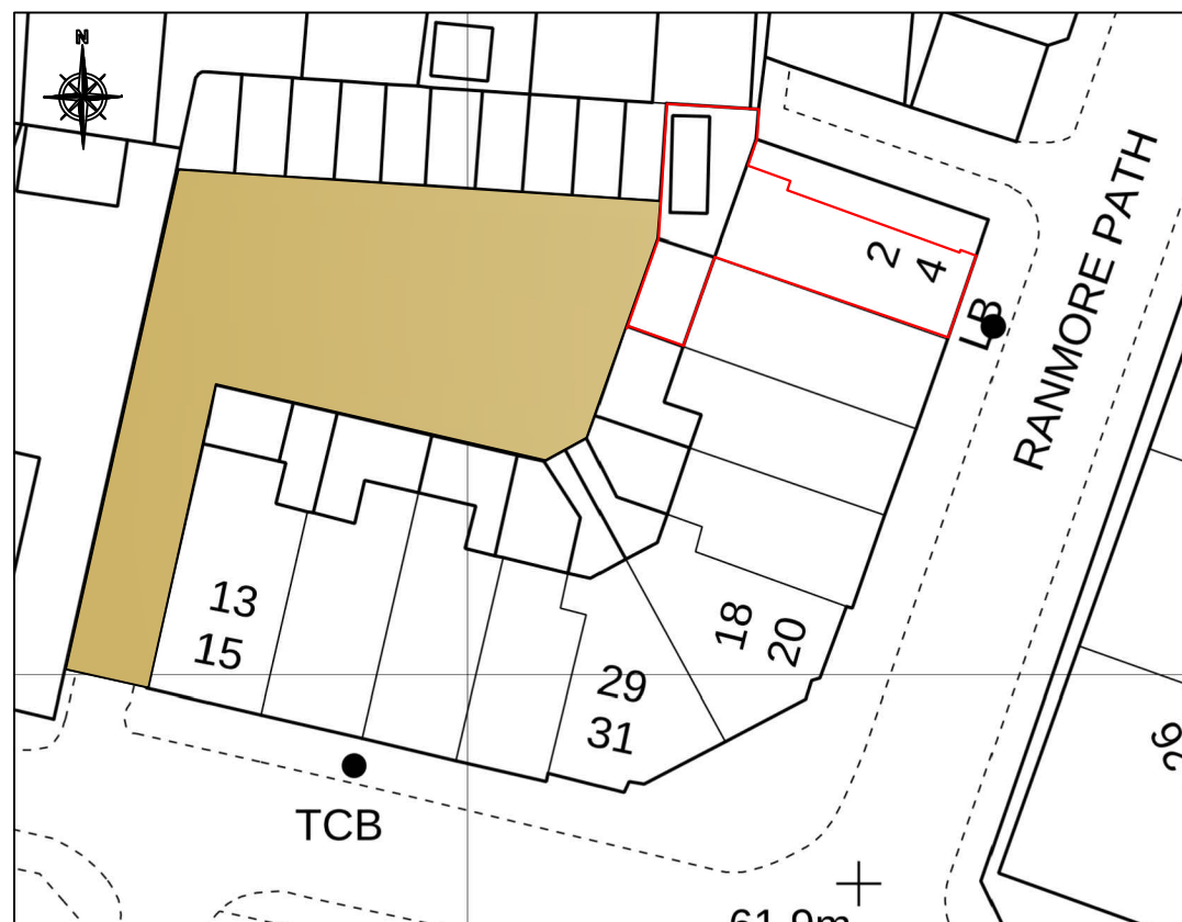
EXTRACT FROM ORDNANCE SURVEY @ 1:500, SHOWING LOCATION