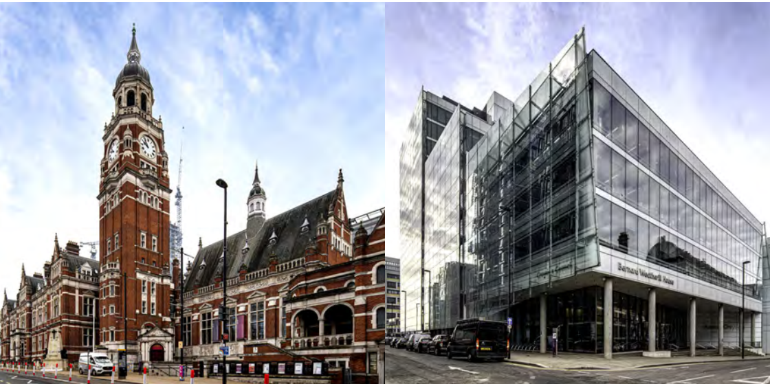
Queen’s Quarter, Croydon, CR9 3JS

Queens Quarter also benefits from exceptional connectivity to many of the landmark destinations in London and beyond. Situated just moments from East Croydon station, it is one of the busiest public transport interchanges in the UK. Regular services provide direct access into Victoria station (17 minutes) and London Bridge station (13 minutes) which in turn link to the London Underground networks. For local travel, there are three tram routes available adjacent to the site which provides useful links from Croydon to Elmers End, Croydon to Beckenham Junction, and Wimbledon to New Addington.