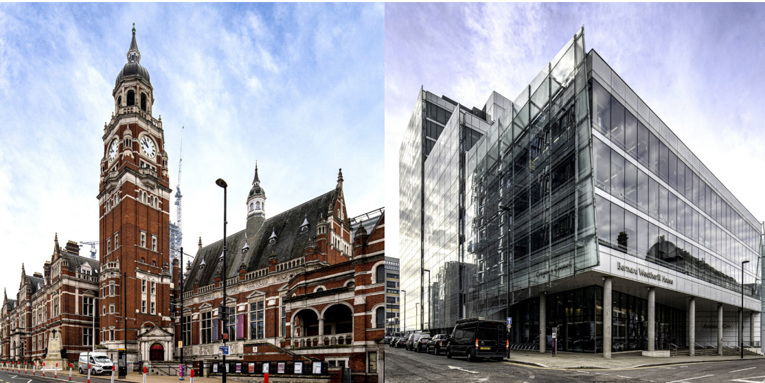
Queen's Quarter, Croydon, CR0

Queens Quarter also benefits from exceptional connectivity to many of the landmark destinations in London and beyond. Situated just moments from East Croydon station, it is one of the busiest public transport interchanges in the UK. Regular services provide direct access into Victoria station (17 minutes) and London Bridge station (13 minutes) which in turn link to the London Underground networks. For local travel, there are three tram routes available adjacent to the site which provides useful links from Croydon to Elmers End, Croydon to Beckenham Junction, and Wimbledon to New Addington.